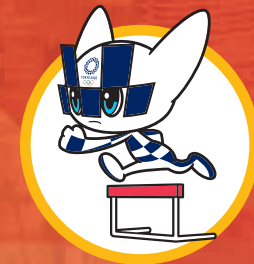
TRACK & FIELD