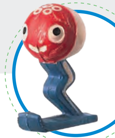
Schuss, Grenoble Olympic Games 1968